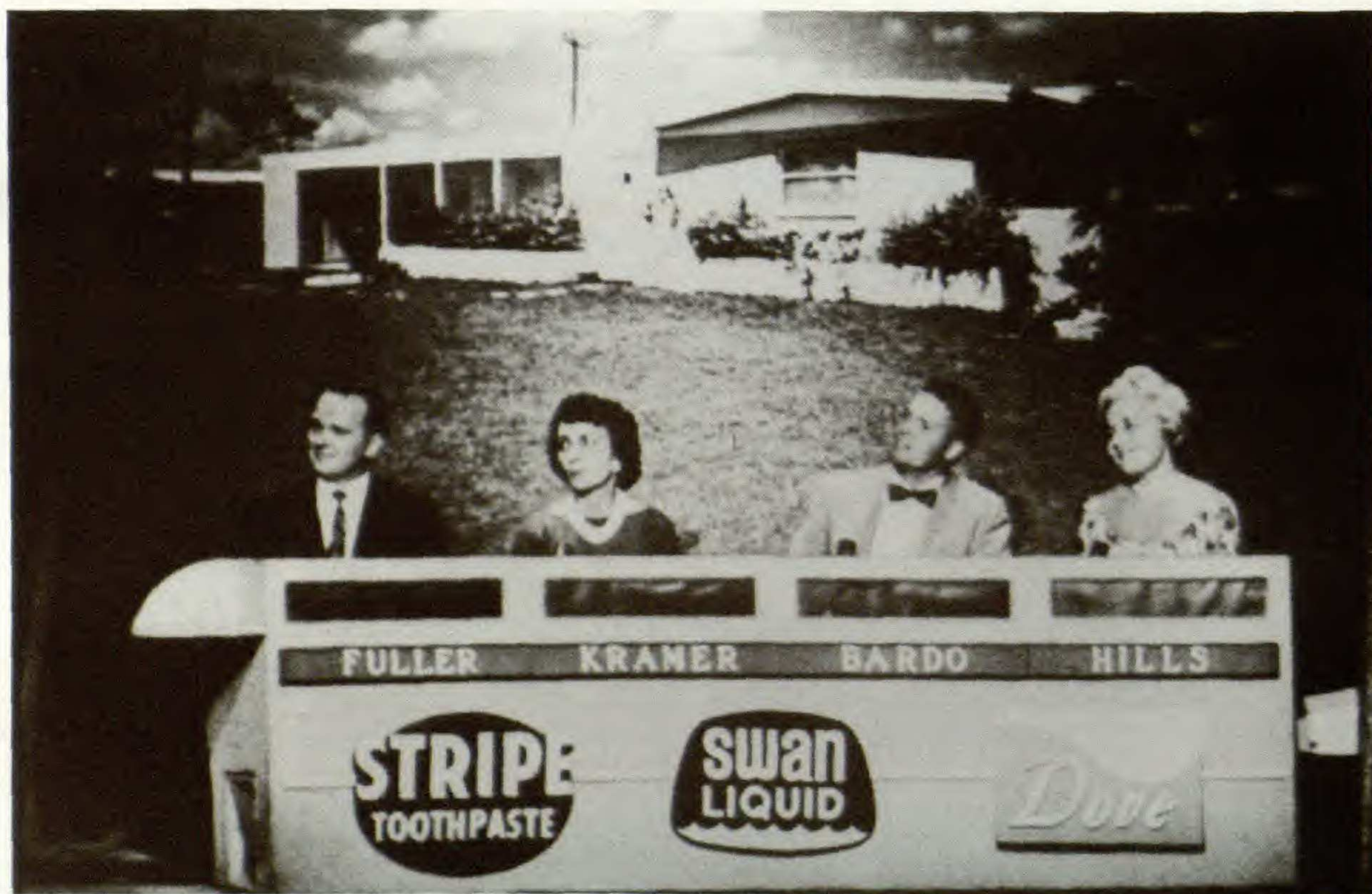
FIGURE 6.—In 1961, TV game show The Price is Right offered as Grand Prize a new south Florida (Lehigh Acres) home located in the logged pinelands that were part of the Hickey's Creek/Lehigh pine logging system. Photo from Board and Bartlett (1985).

During the 1940s and 1950s, cattle also continued to be an important element of the Cape Coral and Lehigh Acres landscapes but this use of those logged lands came to an end during the latter part of the 1950s. Lee County's human population increased dramatically in the post-war years, a time of housing shortages. And many WWII servicemen who had been stationed in Fort Myers returned with their families to establish new homes. So, not surprisingly, most of the cleared land in the Lehigh Acres locale, first transformed into ranchland, soon (by 1954) ended up under the ownership of a development firm initially called Lee County Land and Title Company, and later, Lehigh Development Corporation (Dodrill 1993:6). The developers' marketing strategy to lure families to Lehigh Acres included a 1961 promotion in which a new home was offered as Grand Prize on the TV show "The Price is Right" (Figure 6) (Board and Bartlett 1985:186). Similarly, in 1958, a massive housing development was initiated in the western sector of Lee County's logging system (Dodrill 1993; Zeiss 1983). Today Cape Coral (Figure 1, inset) has become, landwise, the second largest city in area in the south next to Jacksonville, Florida (Gainesville Sun, Sept. 11, 2000).